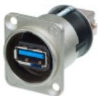
USB type A in front

Certain applications require that the USB 3.0 type A or type B jack is on front to connect end devices like hard disk, cameras, etc. The connector configuration of the NAUSB3* can be changed by rotating the USB insert without special tools.