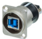
USB Typ B in front