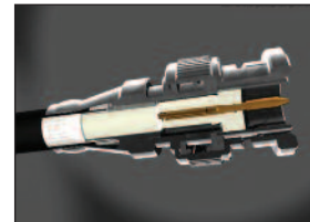
3. Pin Becomes Clearly Visible