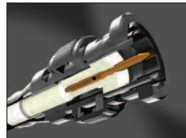
2. Pin is Pushed Through