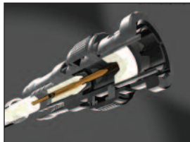
1. Cable Enters Connector

Belden offers the ability to see the cable enter the connector, and for BNC and RCA connectors, a unique pop-up pin confirms a proper termination and contact point. Being able to visually confirm the cable termination means better and faster installation.